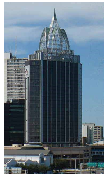
RENAISSANCE MOBILE RIVERVIEW PLAZA HOTEL