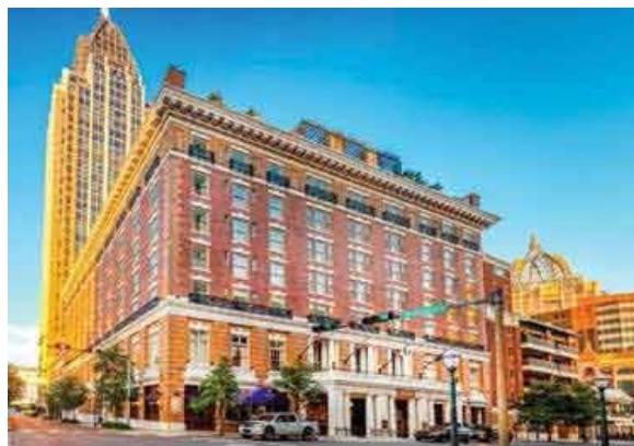
THE BATTLE HOUSE RENAISSANCE MOBILE HOTEL AND SPA