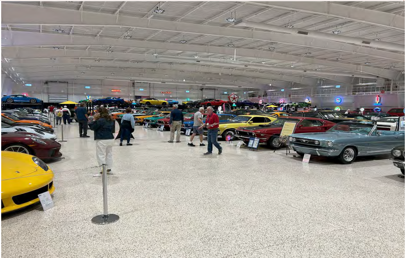
Museum area looking west from center.