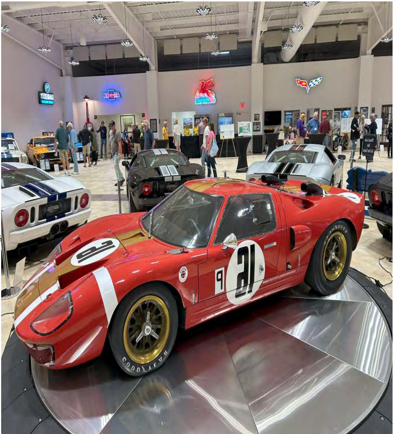
1966 Ford GT-40 MK I LeManns Racer